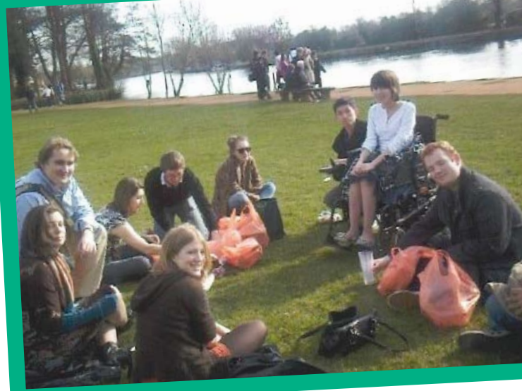
University is a great place to make friends