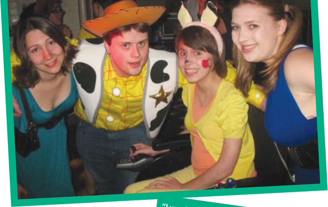
Parties are a big part of university life

"I would advise you to visit the university and ask about local clubs and societies within the university and access to them, supermarkets, leisure centres, shopping malls etc."