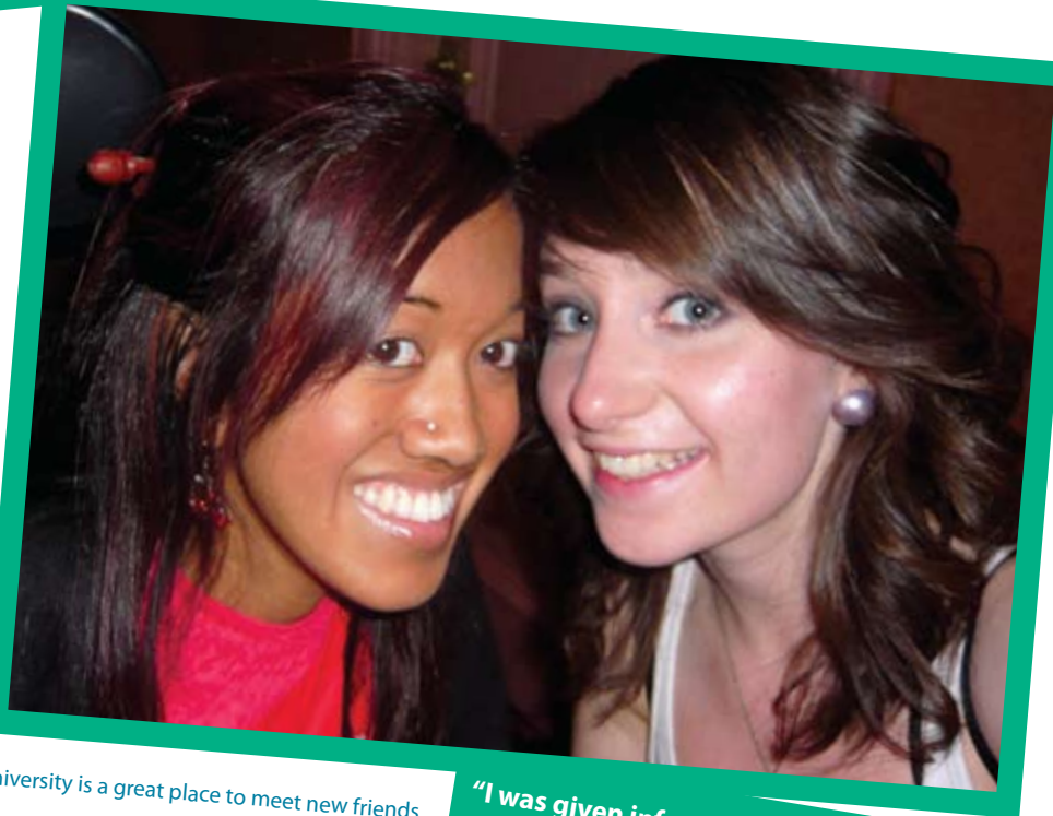
University is a great place to meet new friends