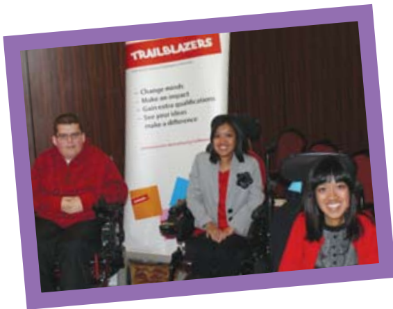
Trailblazers at a regional group meeting

Trailblazers is a nationwide organisation of more than 200 young disabled campaigners. We are part of the Muscular Dystrophy Campaign, the leading UK charity on muscular dystrophy and related neuromuscular conditions. We aim to fight the social injustices experienced by young people living with muscle conditions, and to ensure we can gain access to essential services.